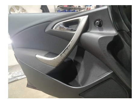
2. DOORS: Trims - condition