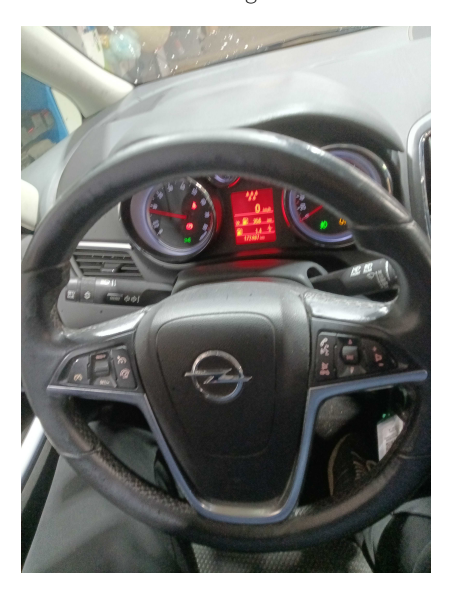
1. FRONT: Steering wheel - condition