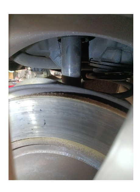
2. BRAKES: Front brake disc (both)