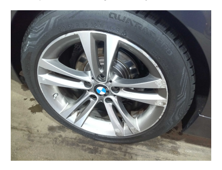
1. SIDE: Wheels - condition