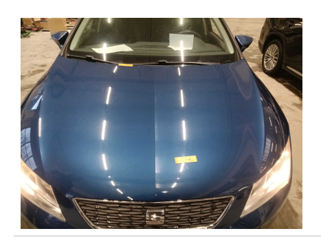
5. LIGHTS: Front lights (city, regular and full headlight, fog, indicator) - basic functioning, damage, color