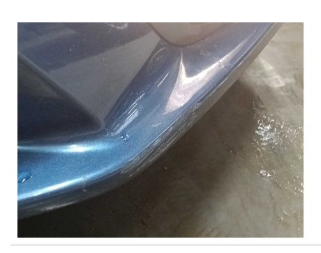
4. FRONT: Hood - visual damage