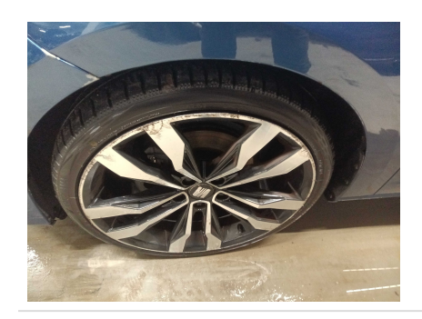
7. SIDE: Left and right side - visual damage / scratches