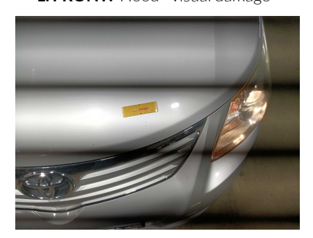
1. FRONT: Hood - visual damage