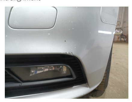
2. FRONT: Hood - visual damage