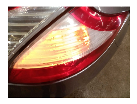
9. REAR: Rear bumper - condition and alignment