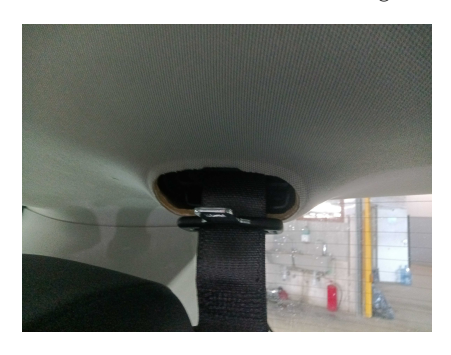
3. SEATS: All seats - condition

2. SEATS: Seatbelts - functioning and locking mechanism