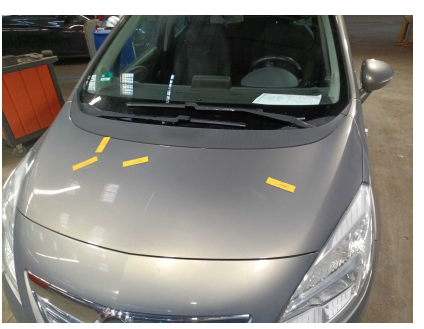
8. OTHER: Roof - visual damage (e.g., hail damage)