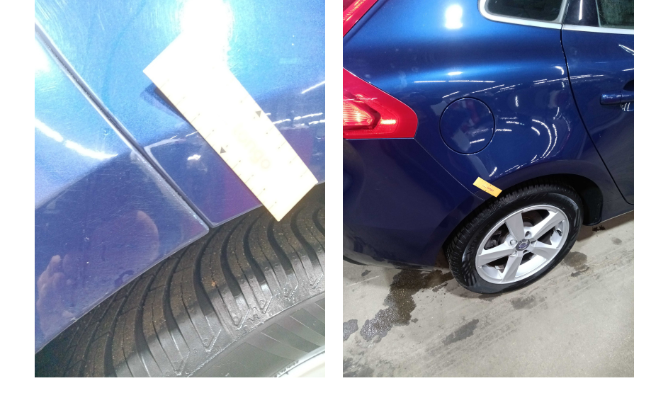
2. SIDE: Left and right side - visual damage / scratches