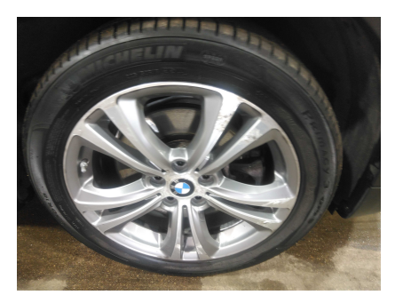
1. SIDE: Wheels - condition