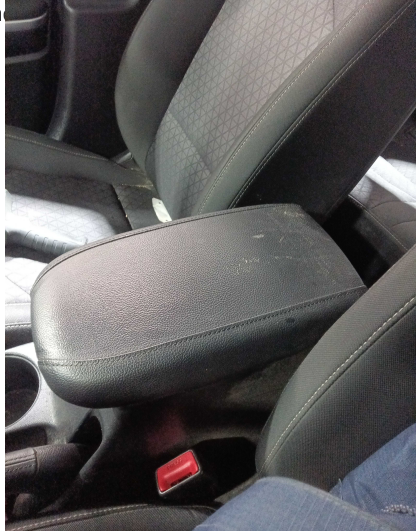
1. INSIDE: Armrest - operation and con