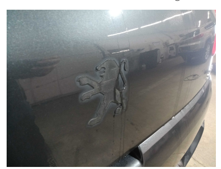
1. REAR: Trunk - visual damage