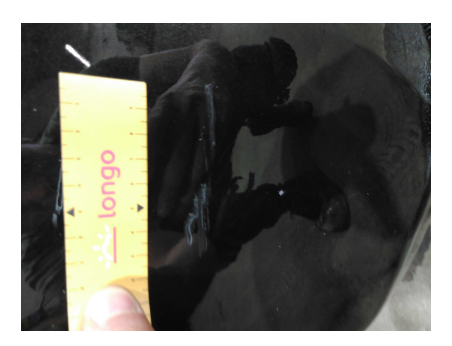
1. REAR: Rear bumper - condition and alignment