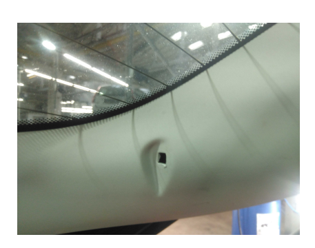
5. INSIDE: Trims - condition