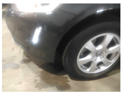
2. REAR: Rear bumper - condition and alignment