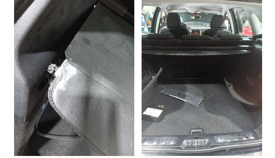
4. INSIDE: Trims - condition