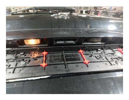
5. REAR: Trunk - visual damage