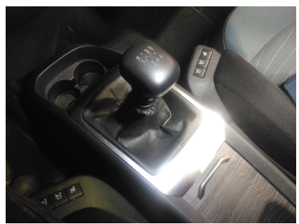
2. INSIDE: Carpets - condition