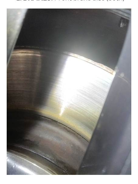
2. BRAKES: Rear brake disc (both)