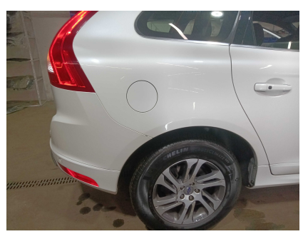
2. SIDE: Wheels - condition