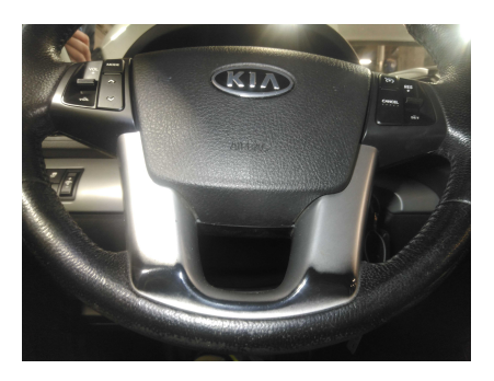
3. INSIDE: Trims - condition