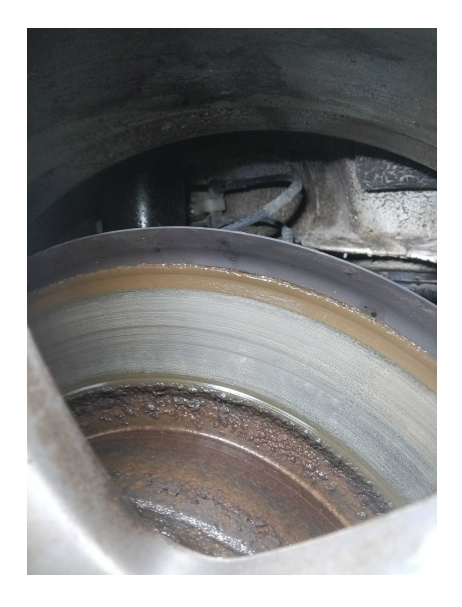
2. SUSPENSION: Suspension lower arm (both)