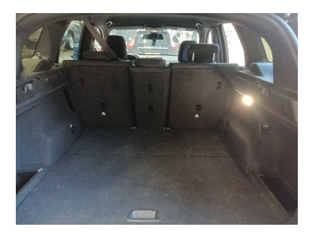
Diagnosis report of 2018 BMW X1 Stock ID: H541112

3. INSIDE: Parcel shelf - operation and condition