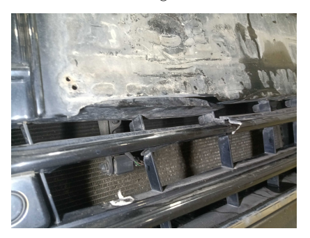
1. FRONT: Front grill - condition