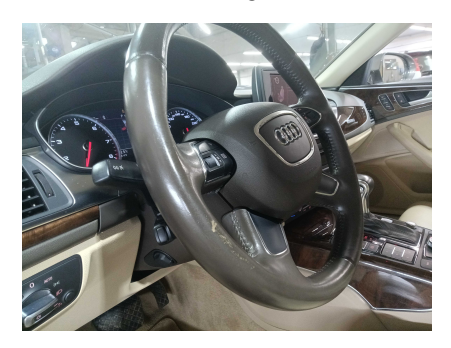
1. FRONT: Steering wheel - condition