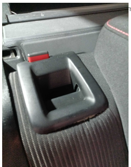
ms - functioning