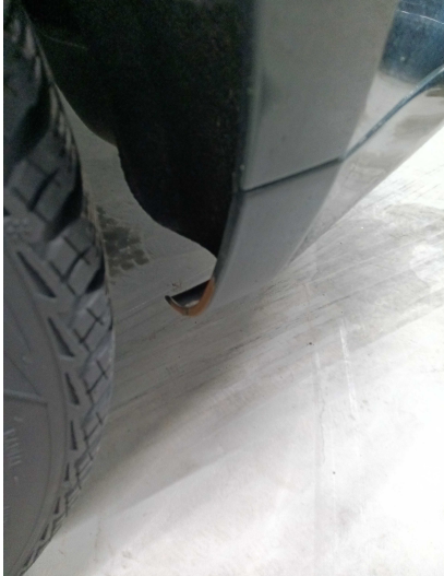
6. REAR: Rear bumper - condition and alignment