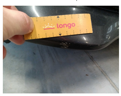
1. FRONT: Front bumper - condition and alignment