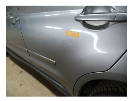
5. SIDE: Wheels - condition

4. SIDE: Left and right side - visual damage / scratches