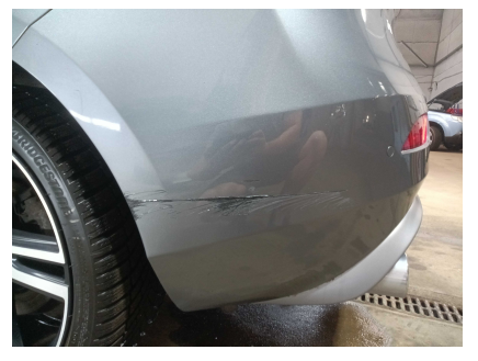
4. REAR: Trunk - visual damage