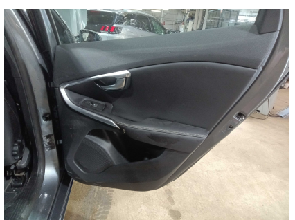
2. FRONT: Trims - condition