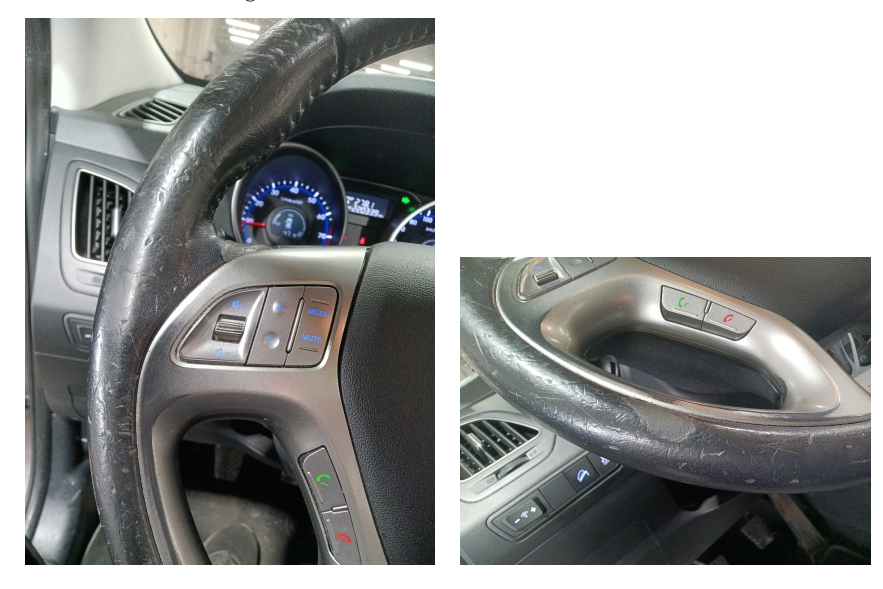
1. FRONT: Steering wheel - condition