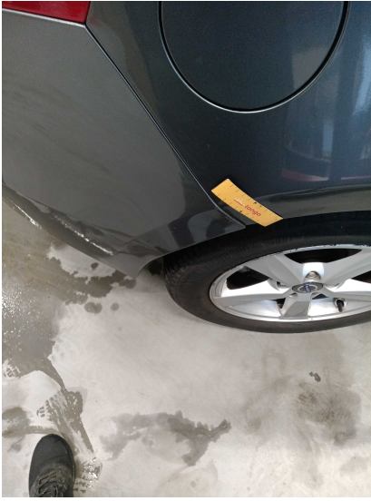
4. REAR: Trunk - visual damage