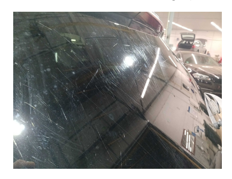
7. REAR: Trunk - visual damage