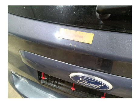
8. REAR: Rear bumper - condition and alignment