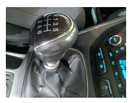
2. FRONT: Trims - condition

1. INSIDE: Gear shift boot/skirt and Gear shift knob - condition