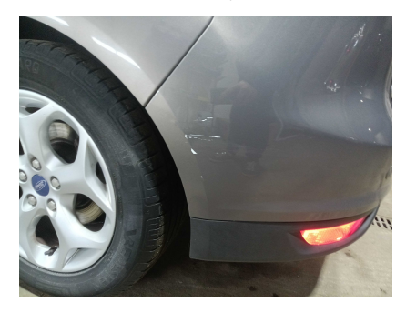
1. REAR: Rear bumper - condition and alignment