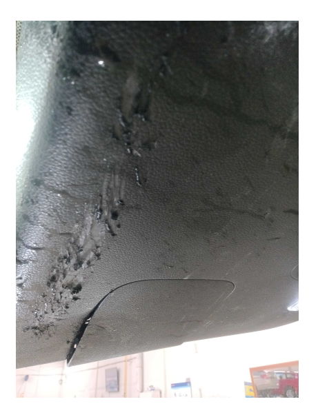
2. DOORS: Door rubber