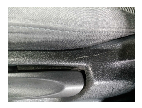
1. SEATS: All seats - condition