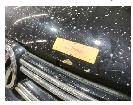
1. FRONT: Hood - visual damage