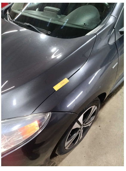
3. SIDE: Left and right side - visual damage / scratches