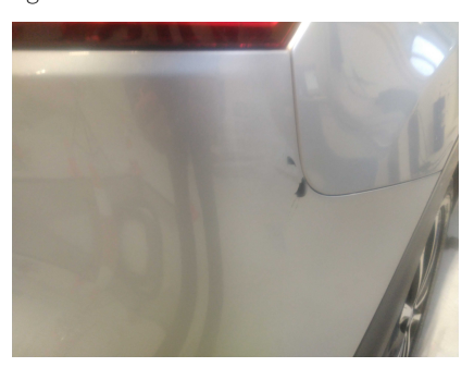
2. REAR: Rear bumper - condition and alignment