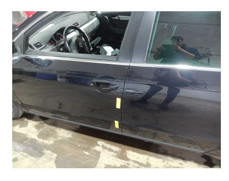
2. SIDE: Left and right side - visual damage / scratches