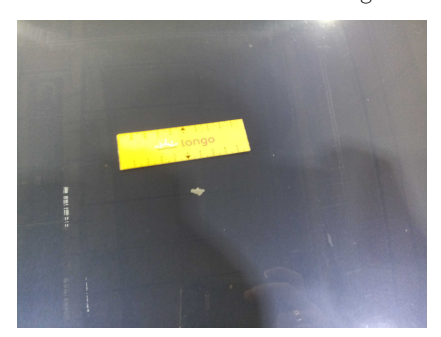
1. FRONT: Hood - visual damage