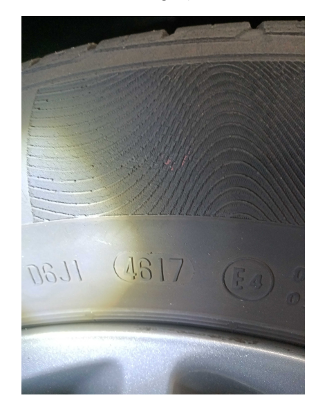
1. OTHER: Change tyres