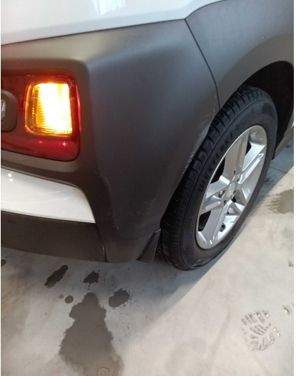
3. FRONT: Front bumper - condition and alignment