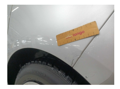
2. SIDE: Left and right side - visual damage / scratches