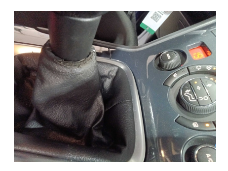
4. INSIDE: Trims - condition