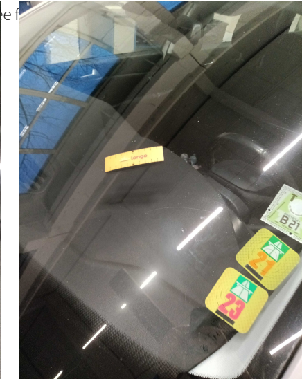
re f vehicle from MOT test