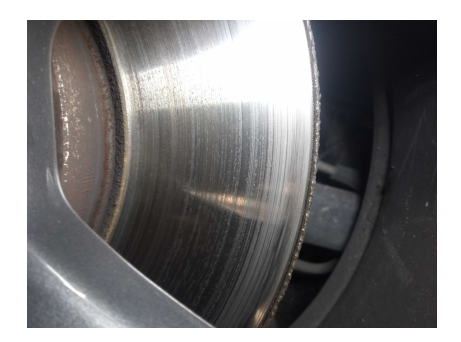
Diagnosis report of 2017 BMW X1 Stock ID: L904361