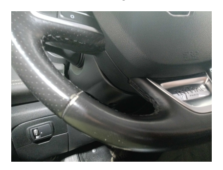
1. FRONT: Steering wheel - condition