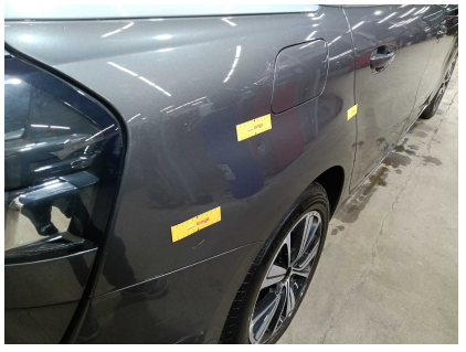
4. REAR: Rear bumper - condition and alignment