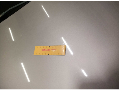
2. FRONT: Front bumper - condition and alignment