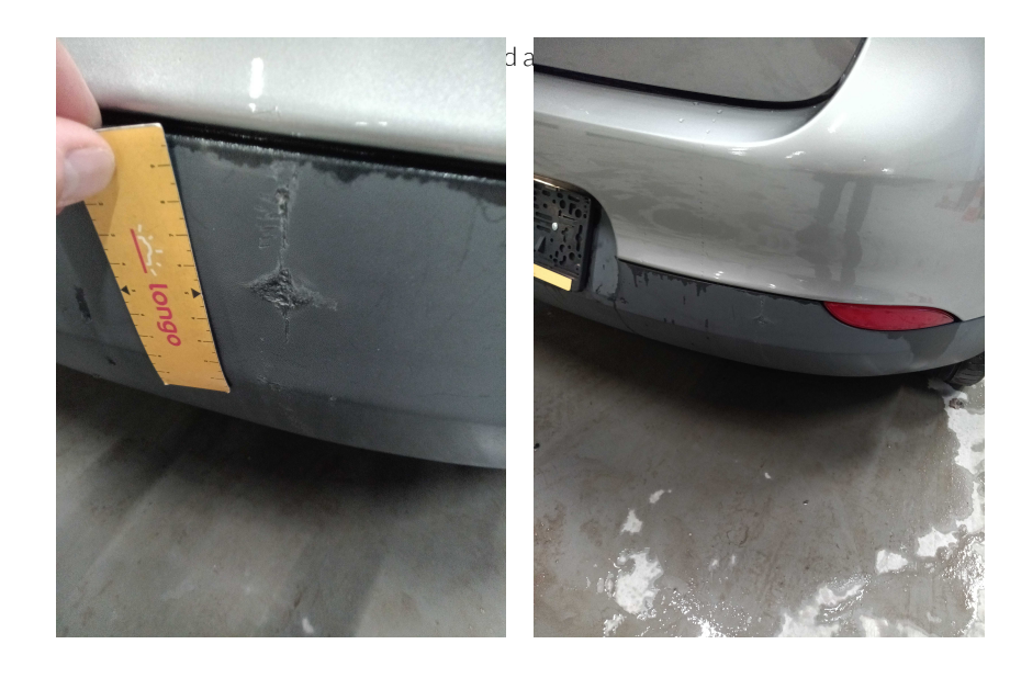
4. SIDE: Left and right side - visual damage / scratches