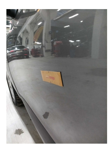
5. SIDE: Left and right side - visual damage / scratches