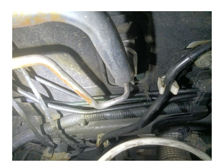
Evaporator - front