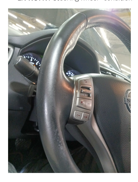
1. FRONT: Steering wheel - condition