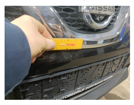
1. FRONT: Front bumper - condition and alignment