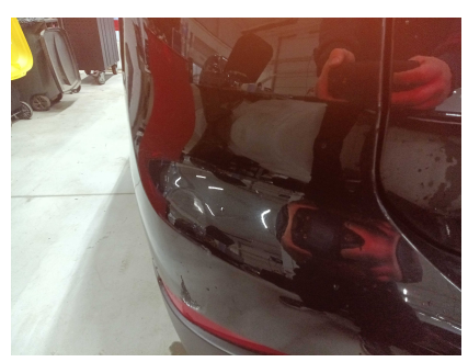
2. FRONT: Front bumper - condition and alignment