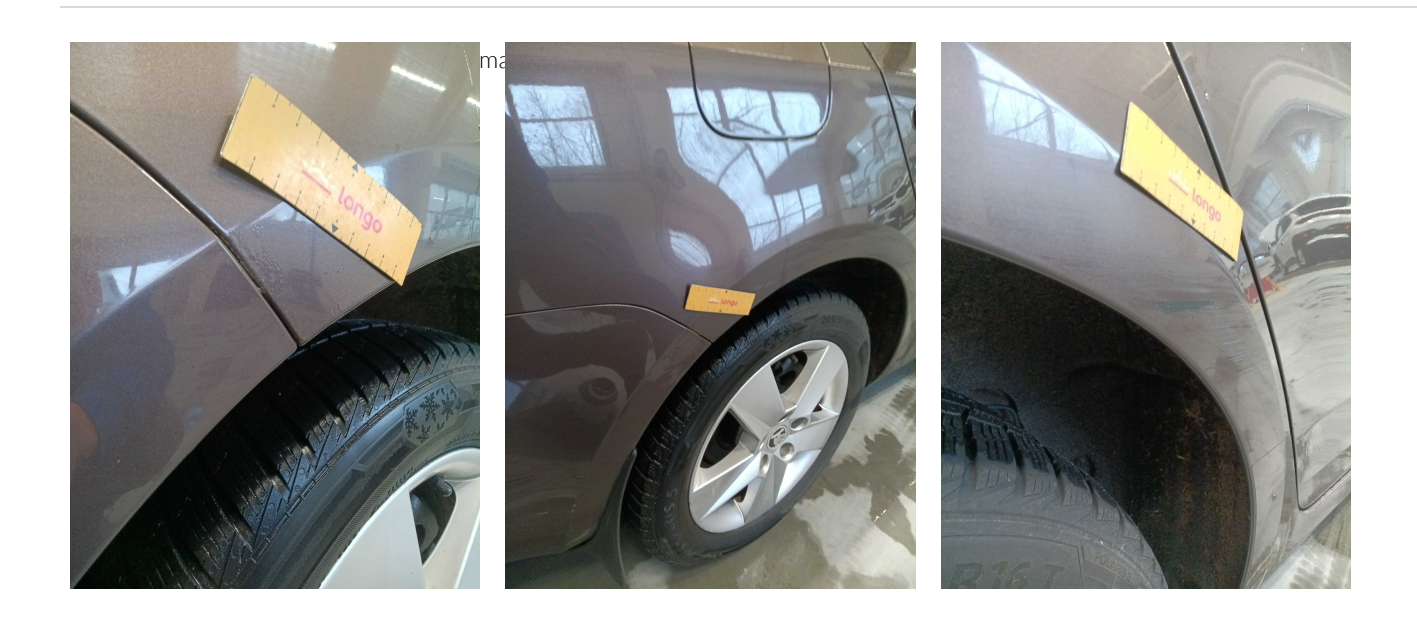
4. REAR: Rear bumper - condition and alignment