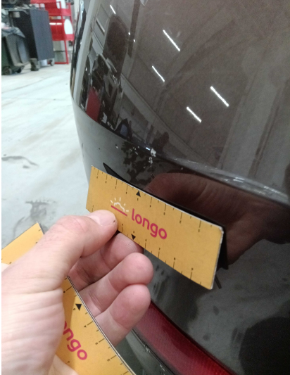
5. FRONT: Hood - visual damage