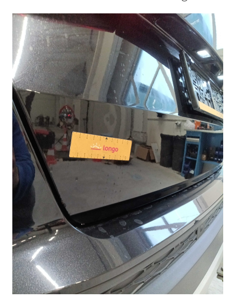
1. REAR: Trunk - visual damage