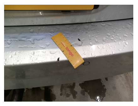
4. SIDE: Left and right side - visual damage / scratches