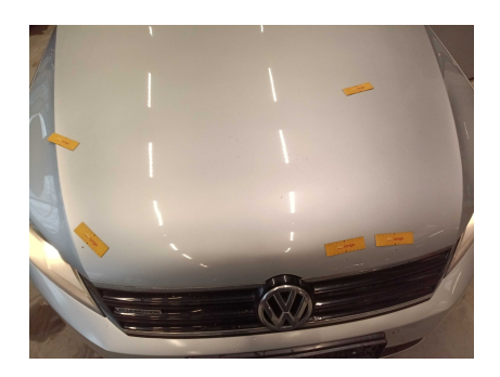
2. OTHER: Roof - visual damage (e.g., hail damage)